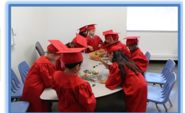
Buel Preschool graduation day