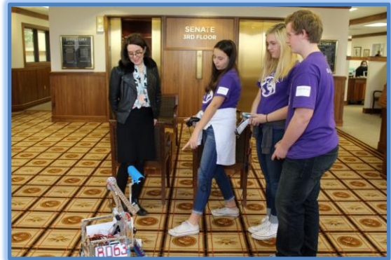
Duniway's First Tech Challenge Team demonstrates their robot build to Governor Kate Brown