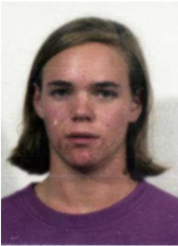
Photograph taken in 1993

Unlawful Flight to Avoid Prosecution - Failure to Appear (Sexual Penetration with a Foreign Object in the First Degree, Sexual Abuse in the First Degree, Sodomy in the Third Degree, Rape in the Third Degree, Sexual Abuse in the Third Degree)