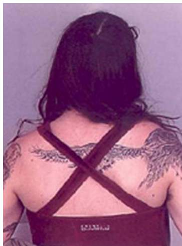
Tattoo of bird on back