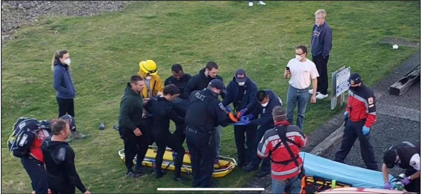
Above: Crews from Seaside Fire & Rescue, Seaside Police and Medix assist shark bite victim. Below: An image of the victim's surfboard which appears to show bite marks.