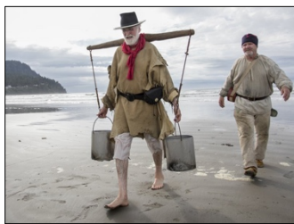
Salt Makers Return