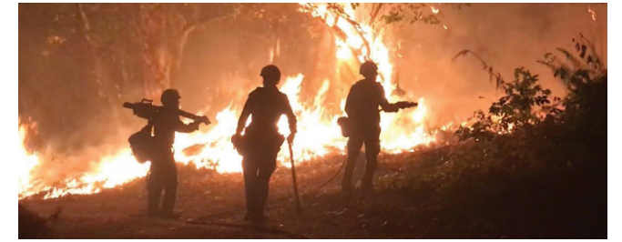
Bolt Creek Fire (WA, 2022)

The outcomes from this research are an important part of Portland's wildfire planning. This research will help us know how to operate our full-scale filtration facility to be more resilient to wildfire impacts. It will also help our treatment operators know how to respond more quickly when an emergency, such as a wildfire, affects our drinking water quality.