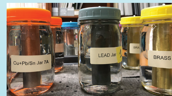
In 2020 and 2021, Water Bureau engineers tested Bull Run water in jars to determine the most effective corrosion treatment to use at the Bull Run Filtration facility

In April 2022, we began treating our drinking water with improved corrosion control. By increasing the water's pH and alkalinity, the improved treatment better protects our water from lead in plumbing materials. Our team spent six months ramping up to full operation to give our drinking water system time to adjust to the changes in water chemistry. The treatment team continues to collect water samples from around the city to evaluate how the improved treatment affects lead levels. These results help us monitor the changes to the system and determine the correct treatment to reduce lead levels as much as possible.