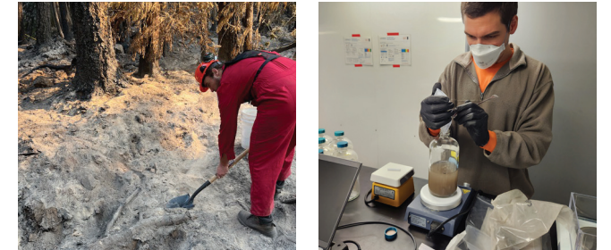
Minnekhada Park Fire (Vancouver, BC, 2022) Water Quality Assistant Paul adds ash to Bull Run water