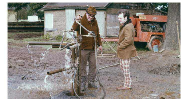
Exploratory well testing in 1976.

temperatures and an atmospheric river of rainfall in November that resulted in increased turbidity in the Bull Run supply.