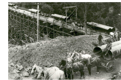
Six-up horse teams and drivers delivering conduit pipe in 1893.

Our commitment began in the late 1800s when Portlanders were getting sick from drinking untreated water from the Willamette River. To keep future generations of residents safe, we laid the first pipes from the Bull Run Watershed to Portland and started serving clean drinking water in 1895.