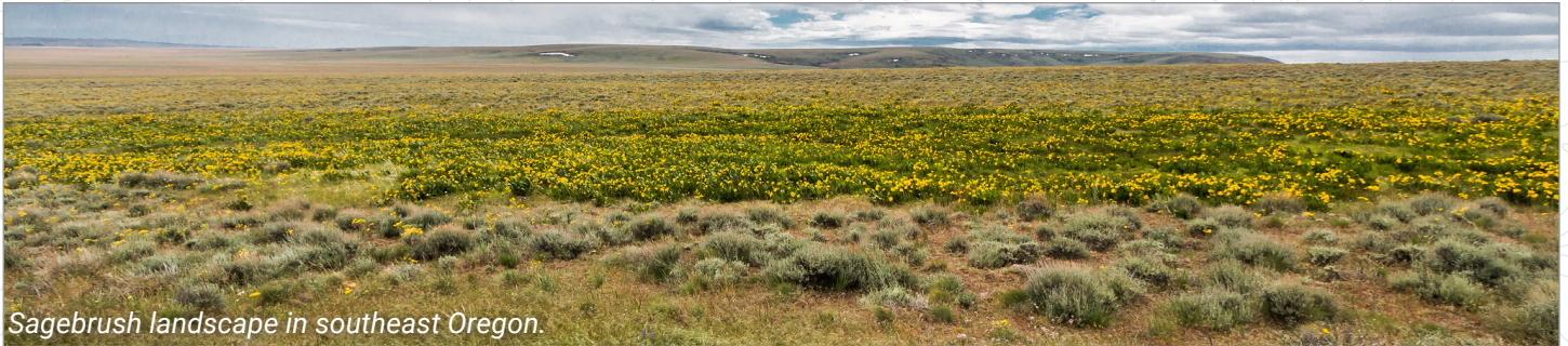
Sagebrush landscape in southeast Oregon.

The Bureau of Land Management is infusing $161 million for ecosystem restoration and resilience on the nation's public lands, as part of the Biden-Harris Administration's Investing in America agenda. The proposed work will focus on 21 "Restoration Landscapes" across 11 western states, restoring public lands, strengthening communities and local economies, advancing climate resilience and furthering our commitment to Tribal collaboration and partnership.