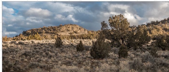
Oregon Badlands Wilderness.

This effort will complement $2.38 million of funding from the Bipartisan Infrastructure Law.